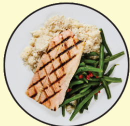
Maple Glazed Salmon $15.00 with Rice Pilaf and Green Beans