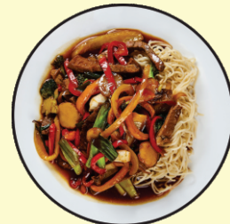
Mongolian Beef Stir-fry $14.00 with Chow Mein Noodles