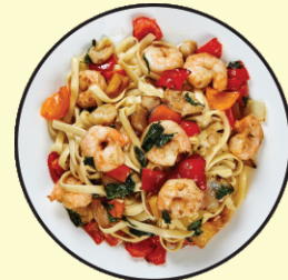
Gulf Coast Shrimp Fettuccine $16.00