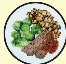
Black Bean Loaf $14.00 with Roast Butternut Squash and Brussels Sprouts