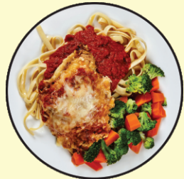
Chicken Parmesan $15.00 with Fettuccine Marinara, Broccoli and Carrots