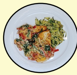
Tuscan Chicken $15.00 with Zucchini Spirals