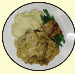
Creamy Mushroom Pork $15.00 with Cauliflower Mash & Green Bean Bundle