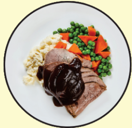
Roast Beef $14.00 with Mashed Potatoes, Peas and Carrots