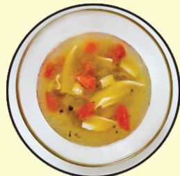
Chicken Noodle Soup

Cream of Mushroom 250 ml $4.50 500 ml $8.00 1 litre $14.00