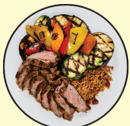
New Mexico Style Steak $16.00 with Rice & Beans and Grilled Vegetables