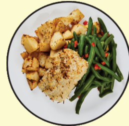
Coconut Crusted Haddock $15.00 with Chili Lime Potatoes Green Beans