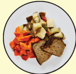
Meat Loaf $14.00 with O'Brien Potatoes and Carrots