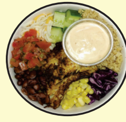
Fish Taco $14.00 with Blackened Haddock Cauliflower Rice, Cucumber Corn, Black Beans, Cheese & Pico de Gallo