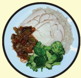
Turkey Creole $15.00 with Rice Pilaf and Broccoli