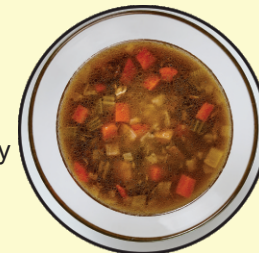
Beef Barley Soup

Cream of Mushroom 250 ml $4.50 500 ml $8.00 1 litre $14.00