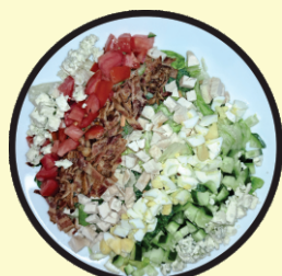
Cobb Salad $14.00