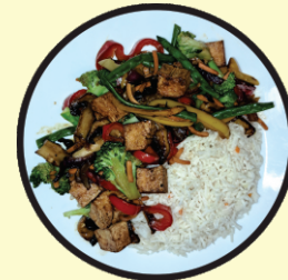
Szechuan Tofu and Veggies $14.00