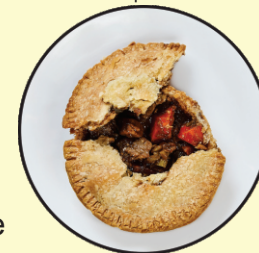
Beef Pot Pie