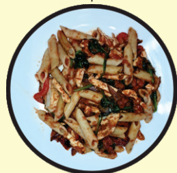
Florentine Chicken Penne