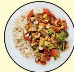
California Nut Stir-fry $14.00 with Rice Pilaf