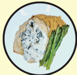
Chicken Scallopini $15.00 with Sweet Potato Mash and Asparagus