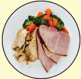
Baked Ham $14.00 with Scalloped Potatoes, Broccoli & Carrots