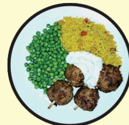
Kofta Kabobs $14.00 with Turmeric Rice and Spring Peas