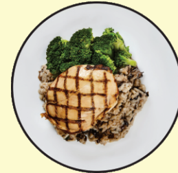
Spinach Stuffed Chicken $15.00 with Mushroom Risotto and Broccoli