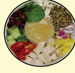
Mediterranean Turkey $14.00 with Roast Turkey, tomatoes Red Onion, Yellow Pepper Cucumbers, Feta Cheese Black Olives & Quinoa