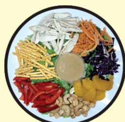
Asian Chicken Salad $14.00