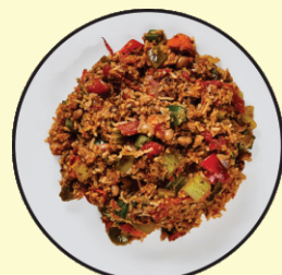
Vegetarian Jambalaya $13.00