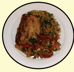
Teriyaki Salmon Stir-fry $16.00 with Cauliflower Fried Rice